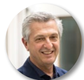
Filippo Grandi UN High Commissioner for Refugees

« Refugees face two journeys, one leading to hope, the other to despair. It is up to us to help them along the right path. »